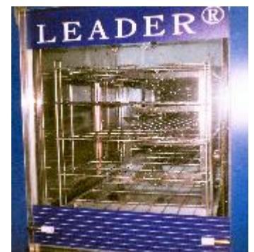
glass door allow visual inspection of wash spray operation