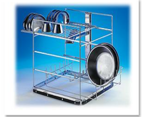
BASIN BASKET AND INSTRUMENT BASKET (Up to 15 DIN trays)